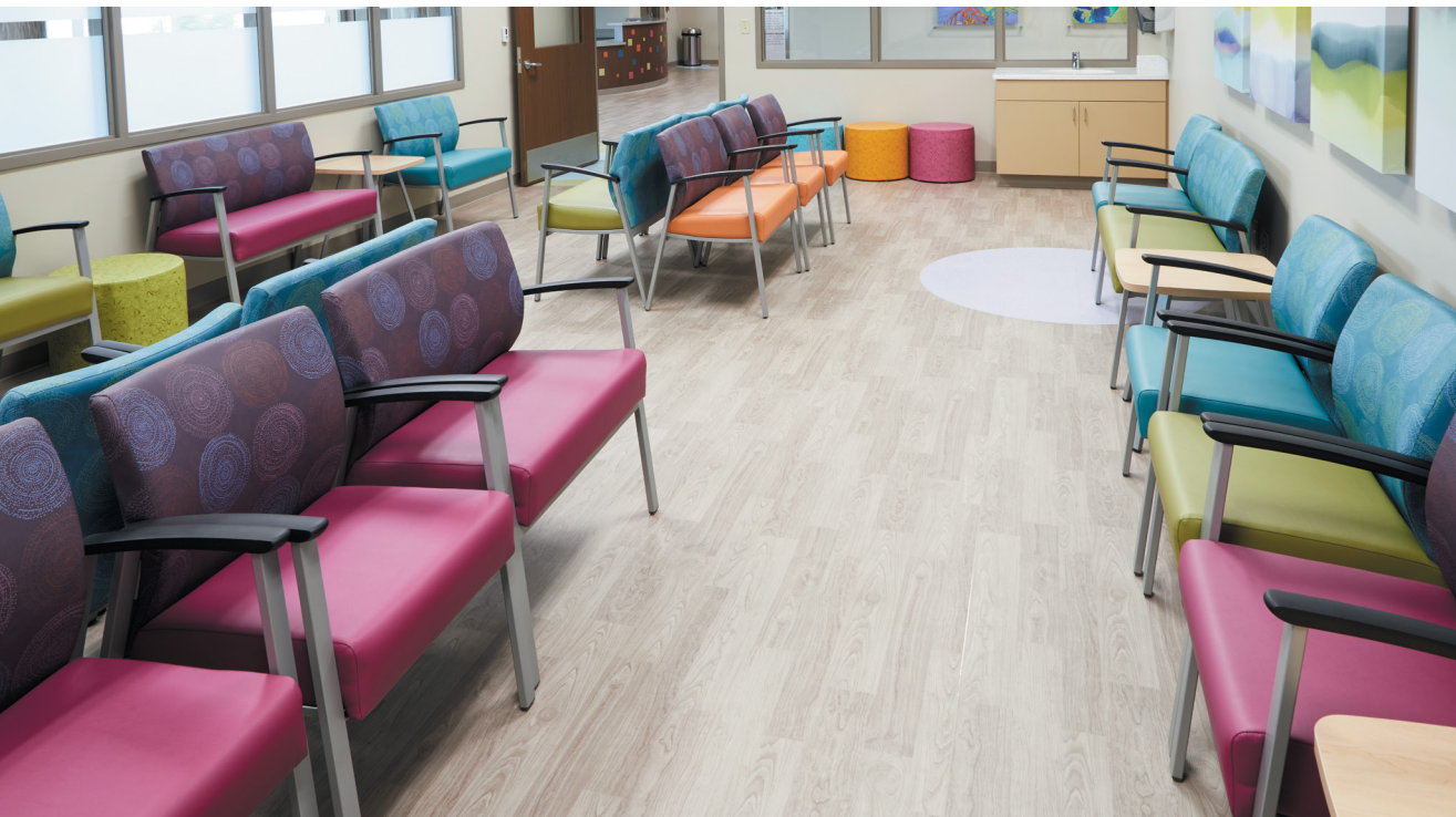
Top: Hub modular seating, Dōni stack chairs, Apply café stools, Pirouette tables Bottom: MyPlace rounds, Soltice Metal bariatric chairs, multiple seating and occasional tables Back Inside Cover: Genius architectural wall