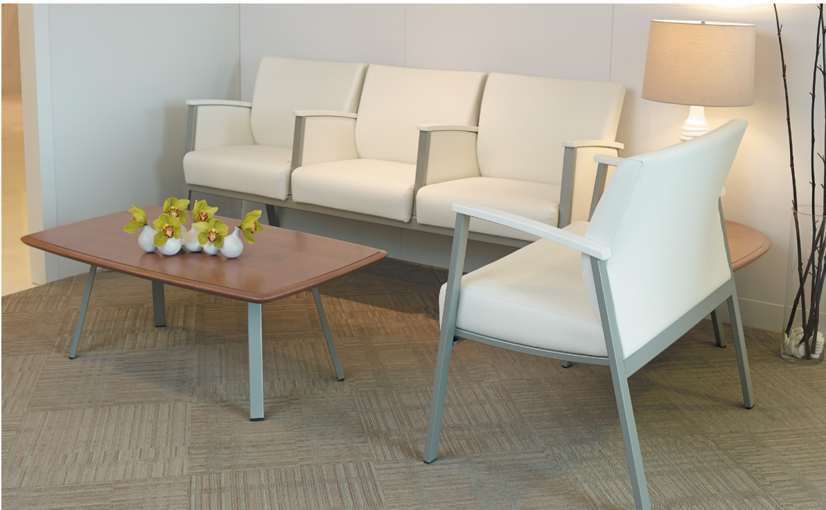
Top: MyWay lounge seating Bottom: Soltíce Metal multiple seating and occasional table