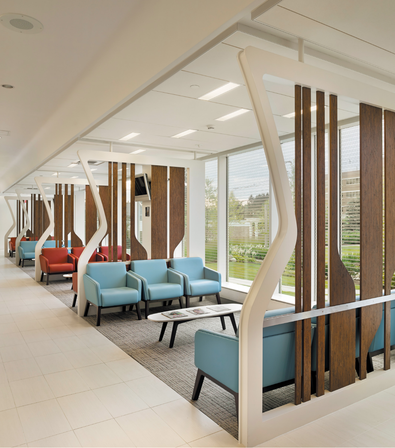
Lyra lounge chairs, Lyra occasional tables