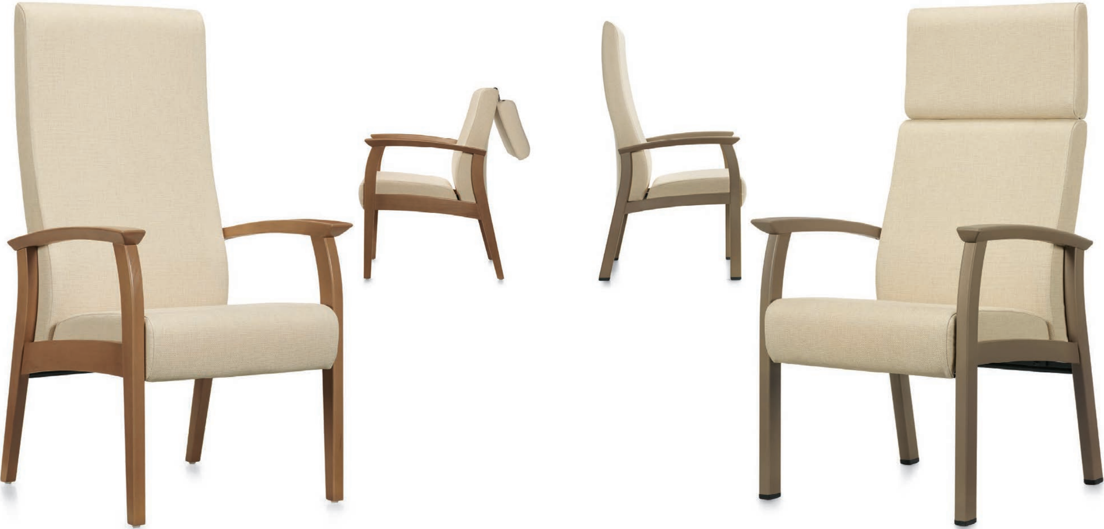
Primacare patient high back chair with open arms and patient high split back chair with open arms.

A better fit. Primacare™ patient seating features an ergonomically-contoured back and built-in lumbar support, which can be enhanced with a flexing back for increased comfort or a fold-down upper back that enables caregivers to assist patients safely. “Tip and move” rear casters are optional on HT models, allowing the chair to be moved easily within the space (not for patient transfer).