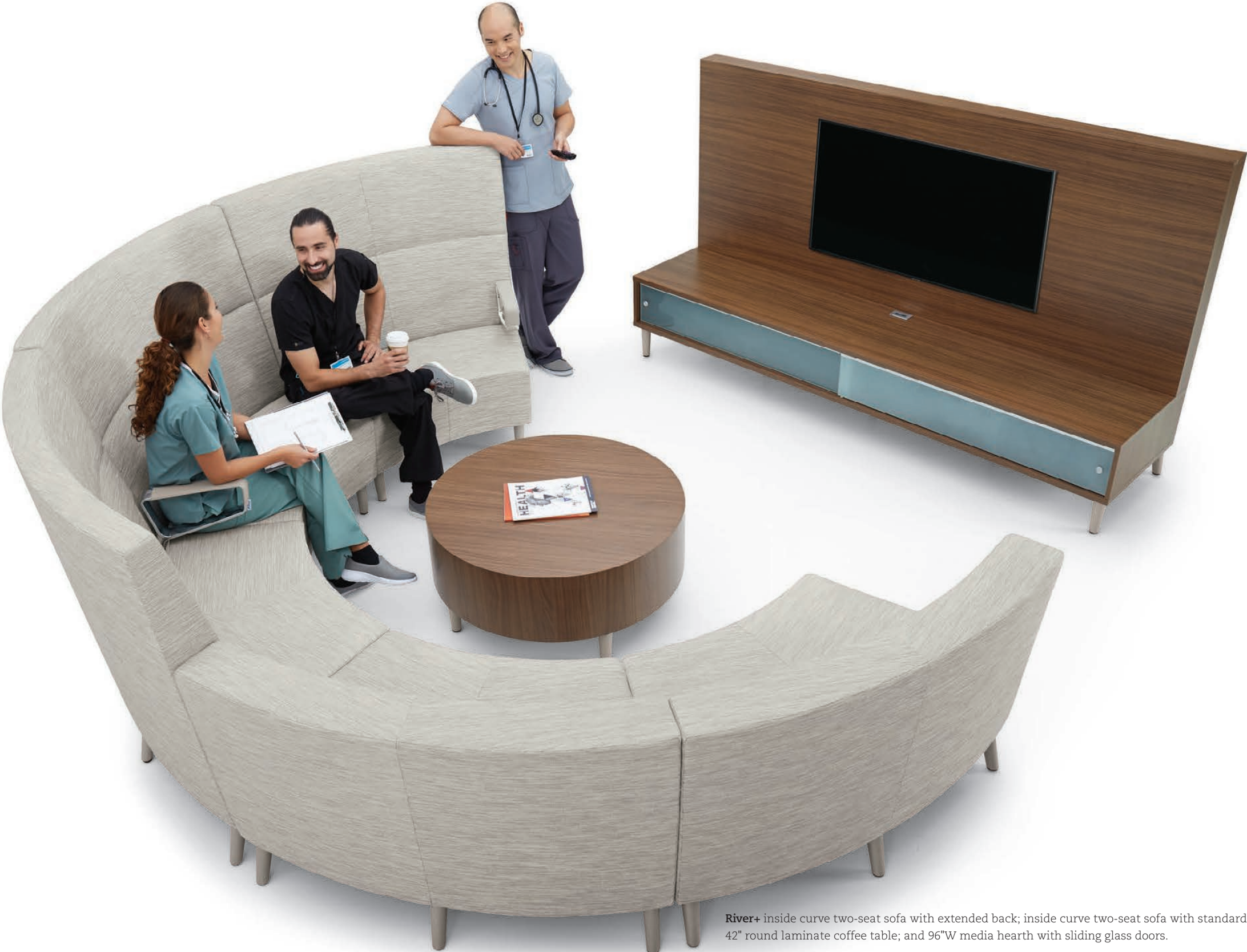
River+ inside curve two-seat sofa with extended back; inside curve two-seat sofa with standard back; 42" round laminate coffee table; and 96"W media hearth with sliding glass doors.

The series offers three back heights, multiple seat heights, and supports linear, curvilinear, 90-degree and 120-degree configurations. Elegant polished aluminum arms are fully modular and can be installed and relocated on-site to add support where required and adapt when needs change.