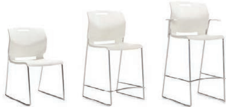
Popcorn armless chair with upholstered seat and polypropylene back; armchair with polypropylene seat and back; armless chair with polypropylene seat and back; armless counter stool with polypropylene seat and back; and bar stool with arms, polypropylene seat and back.