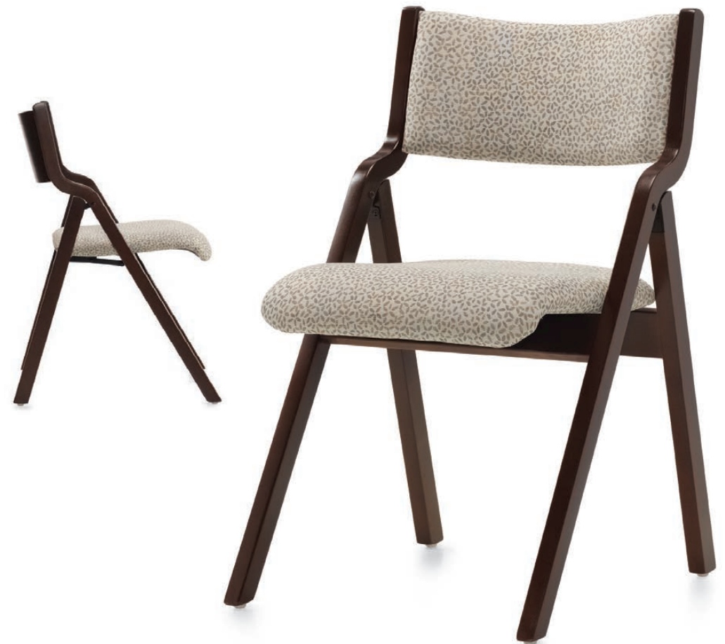
Janna folding chair with upholstered seat and back, and folding chair with upholstered seat and wood back.

The unique folding frame on Janna® makes it the perfect solution for temporary seating, especially where space is at a premium. An optional wall bracket allows the chair to be conveniently stored while not in use. Available in your choice of an upholstered or wood back.