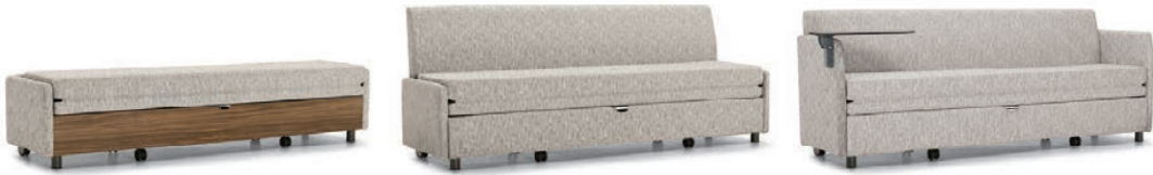
Dreme sleeper with back, arms and laminate front; armless sleeper with laminate front; armless sleeper with back; and sleeper with back, arms and tablet.