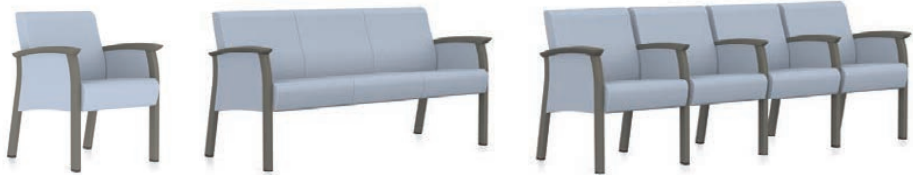
Primacare HT guest low back single seater with open arms; guest low back three seater with open arms; and guest low back four seater with open center arms.