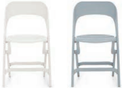
Flap folding chair; dolly for Flap folding chairs; and wall hook.