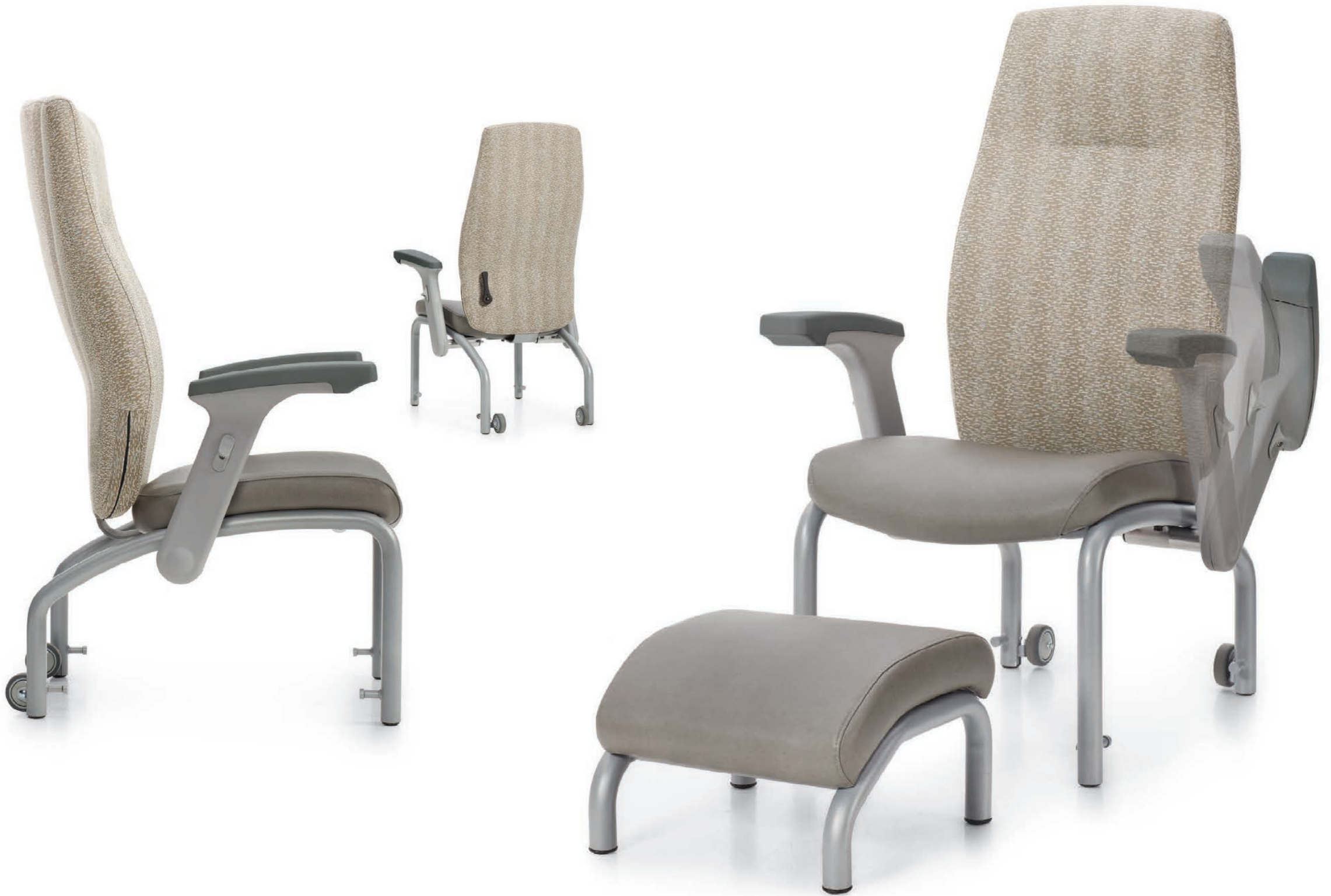
Nourish high back patient chair with adjustable built-in headrest and ottoman. Push bar is optional.

Nourish™ was developed in consultation with leading healthcare professionals as a “perfect patient chair.” It offers several unique and important features including, height adjustable legs, transfer arms, and tip and move wheels to benefit patient and staff interaction with the chair.