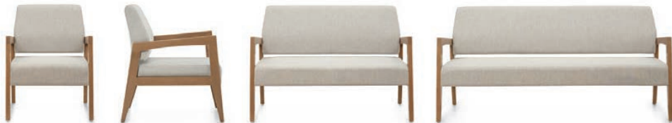
Calidon wood lounge single seat with closed arms and optional power/USB; 22" square end table; 36" square coffee table; wood lounge three seater with closed arms and optional power/USB; wood lounge two seater with closed arms and optional power/USB; and single seat bench.