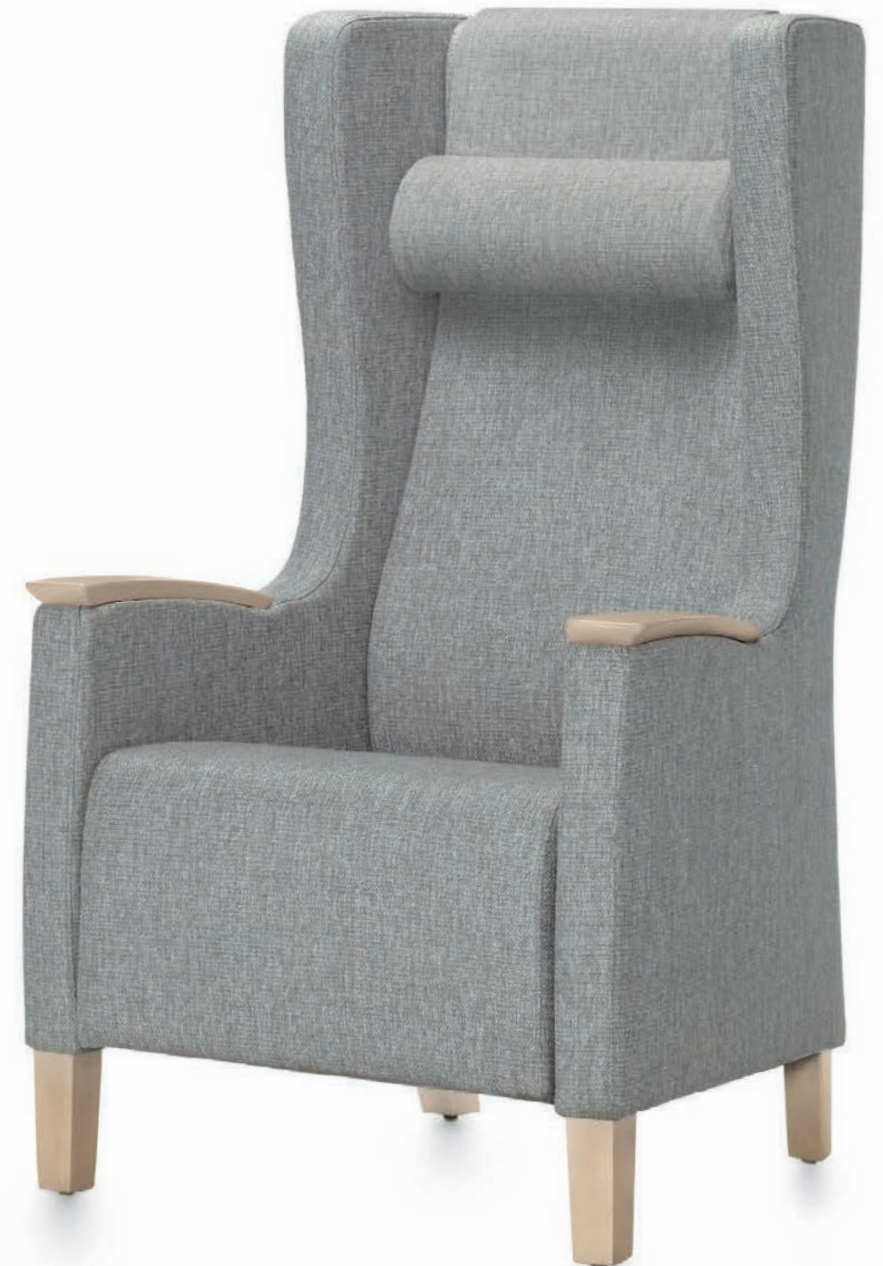
Primacare single seater wingback armchair with headrest.

Primacare™ wingback has a healthcare compliant design that includes seat clean out, adjustable neck support cushion, integrated lumbar support and forward grasping armcaps in wood or urethane. Primacare wingback is available in standard, bariatric and two seater models with optional ottomans.