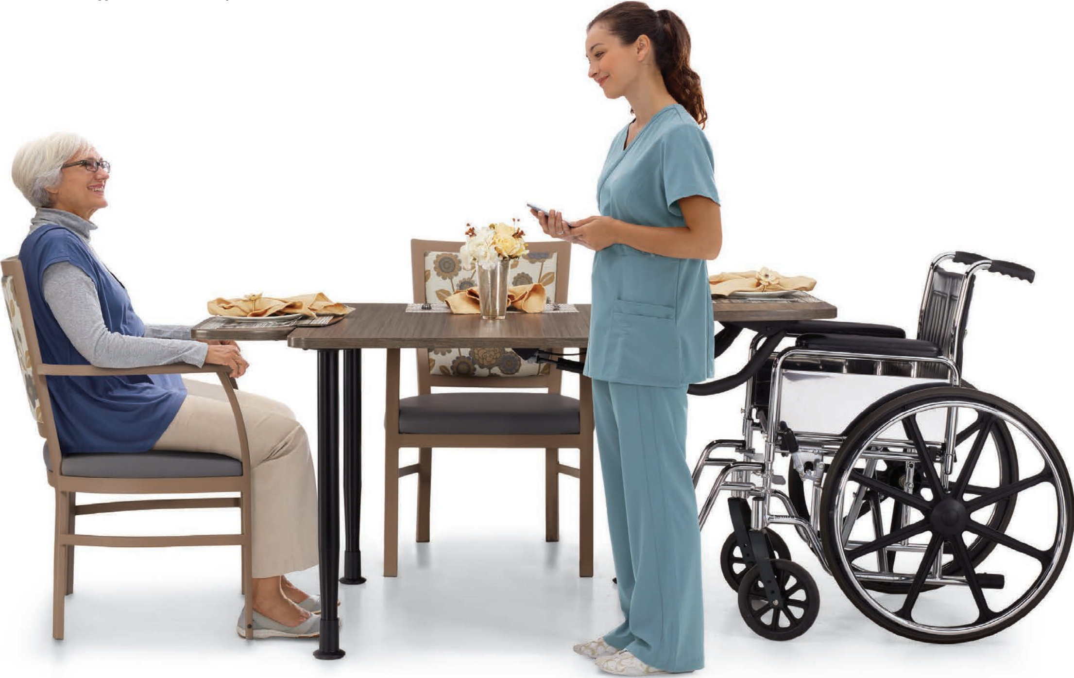
Desmond HT metal armchair. Enable table multi-purpose table with high pressure laminate top, fixed height and E-Z lift dual arm tablets in high pressure laminate.

Make it comfortable. Desmond™ dining chairs have been sized specifically to suit both elder care and acute care applications. Available in your choice of wood or metal frames.