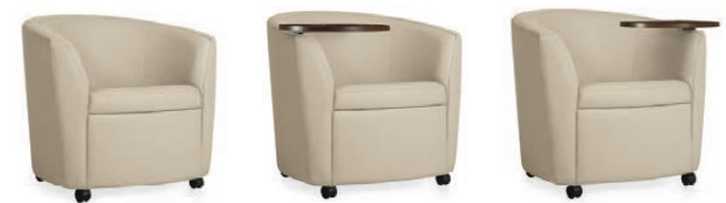
GC Sirena club chair; club chair with casters; club chair with right laminate tablet and casters; and club chair with left laminate tablet and casters.