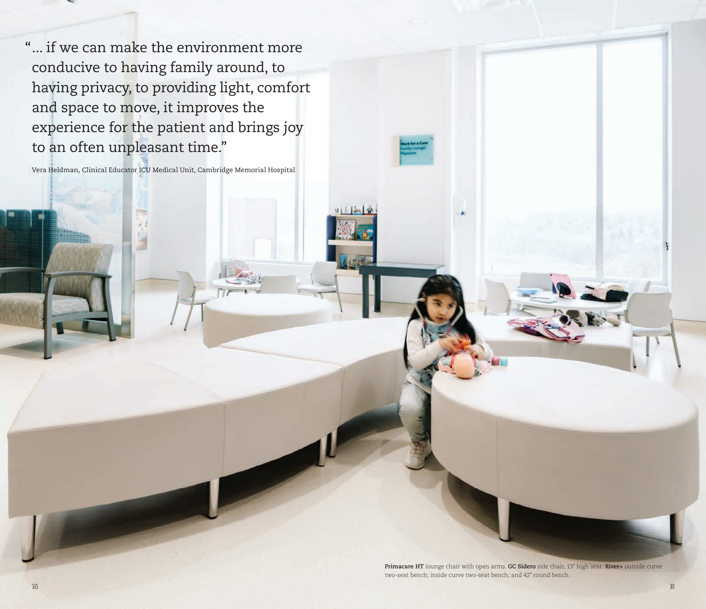
Primacare HT lounge chair with open arms. GC Sidero side chair, 13" high seat. River+ outside curve two-seat bench; inside curve two-seat bench; and 42" round bench.

Vera Heldman, Clinical Educator ICU Medical Unit, Cambridge Memorial Hospital