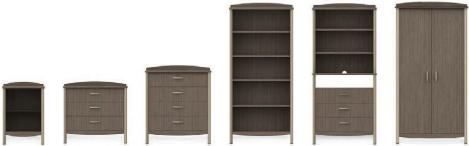
Sonoma bedside cabinet with three drawers, pull out shelf and rear casters; bedside cabinet with adjustable shelf and rear casters; three-drawer dresser; four-drawer dresser; bookcase with five shelves; open hutch with fixed and adjustable shelves, three-drawer dresser with open storage space; and two-door wardrobe with fixed and adjustable shelves, full height storage. Corian® surface available.

Aldon™ offers an affordable and personalized solution for patient and resident room furniture. Bedside cabinets and wardrobes are available in a variety of configurations. Aldon dressers are available with full-width or half-width drawers for shared use in double occupancy rooms.