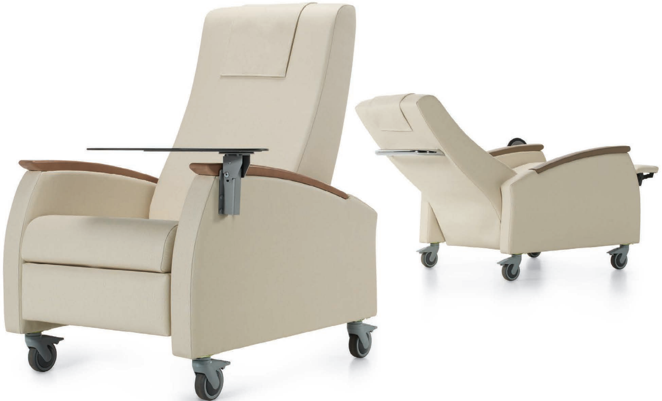
Primacare motion recliner with solid wood armcaps, casters and optional tablet arm.

Better by design. Primacare™ motion recliners follow the patient's intuitive response to reach for the arms when they want to come to a seated position. This simple action overcomes patient stress and concerns if a caregiver is not immediately available.