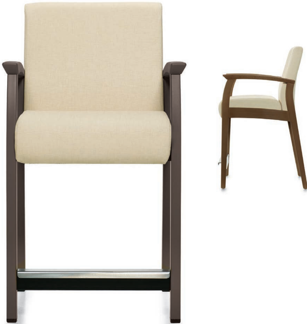
Primacare HT patient low back hip chair with open arms and Primacare patient low back hip chair with open arms.

Primacare™ hip chairs take full advantage of Primacare's superior engineering and construction, including a higher seat, step rail and a more generous seat width for patients transitioning from surgery.