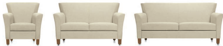
Senator armchair, two seat sofa and three seat sofa.