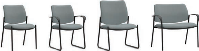
GC Sidero low back mid size armchair; low back armchair; low back side chair; low back armchair with sled base; high single-piece back mid size side chair with sled base; and low back bariatric armchair.