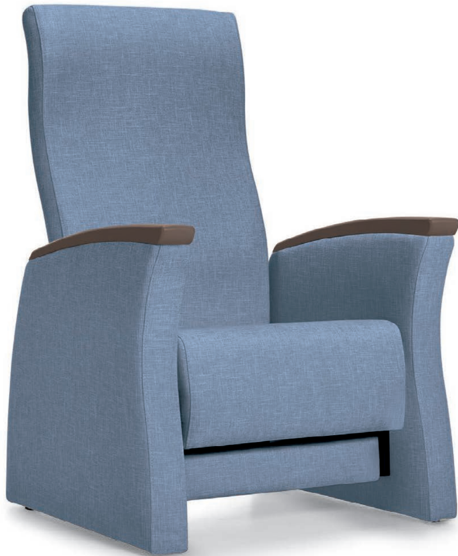
Coast glider/motion chair.

Be comfortable in Coast™. The Coast glider offers a smooth low-range rocking motion to help users relax. Designed with safety in mind, Coast's uniquely curved armrests remain stationary to provide a safer way for the user to get in and out of the chair.