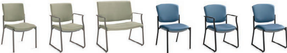
Frolick armchair with rectangular back and concealed attachment; side chair with rectangular back and concealed attachment; armchair with rectangular back, concealed attachment and sled base; and bariatric armchair with rectangular back and sled base. Splash fan back four-legged armchair with concealed attachment; fan back four-legged side chair with concealed attachment; fan back armchair with concealed attachment and sled base; and fan back side chair with concealed attachment and sled base.