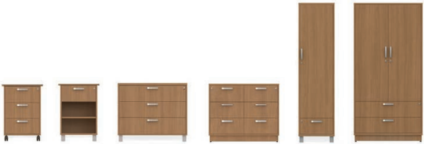
Aldon bedside cabinet with drawer, right opening door and metal legs; bedside cabinet with three drawers and casters; bedside cabinet with drawer, adjustable shelf and metal legs; dresser with three drawers and metal legs; double dresser with six half drawers and plinth base; narrow wardrobe with drawer, fixed upper shelf, coat rail and metal legs; and divided wardrobe with two drawers, fixed upper shelf, coat rail and plinth base. Corian® surface available.