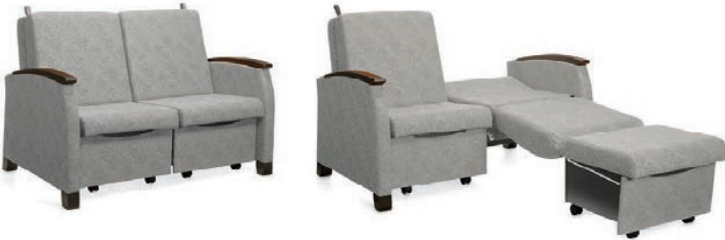
Primacare wide single sleeper and wide double sleeper.